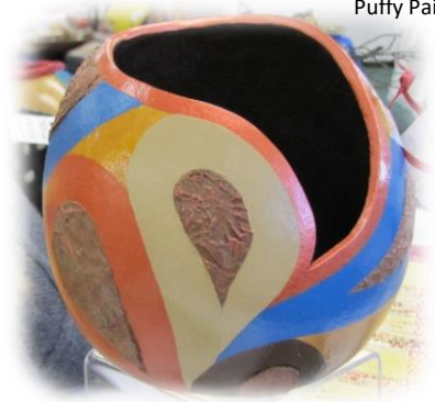
Pat Kelly Puffy Paint Workshop