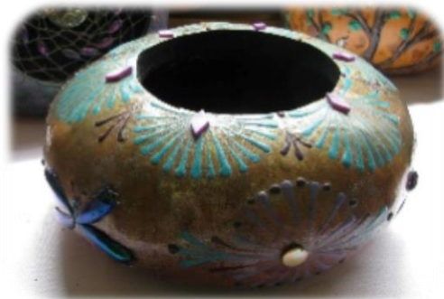
Julia Hayes Crayon Workshop