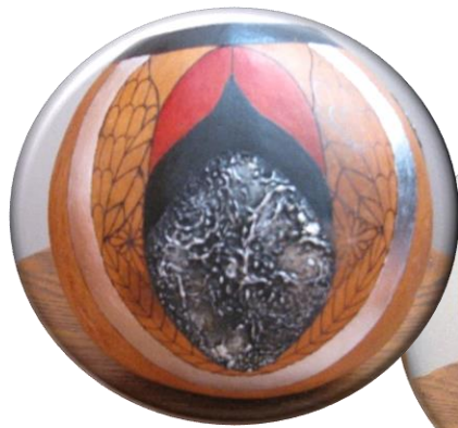
Anne Carling Puffy Paint Workshop