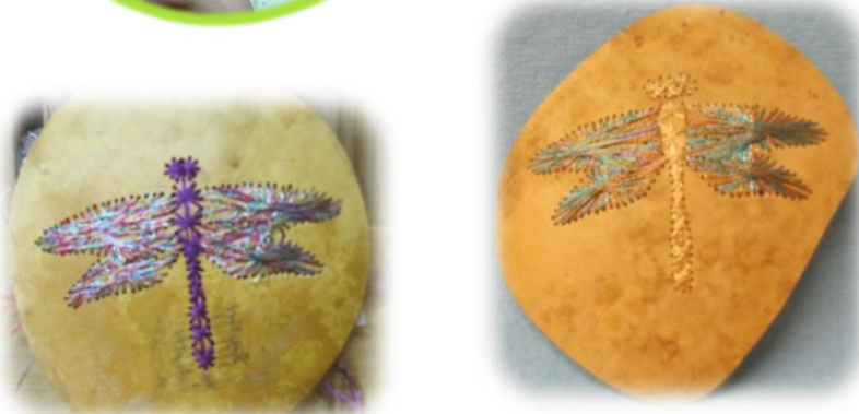
Embroidery on Gourd Workshop Beautiful Results!