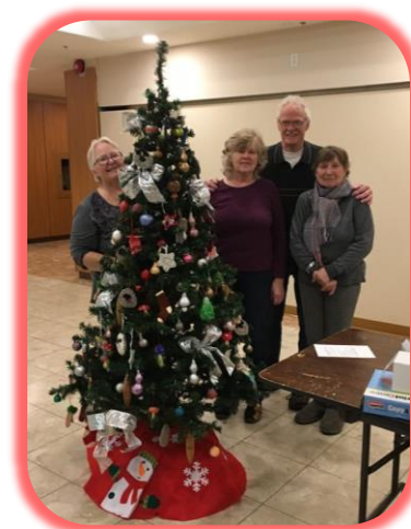
Decorating for the Peterborough Winterfest Tree Raffle.