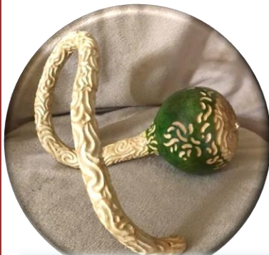
"Comet" is a dipper gourd with an extremely long handle. I have carved the entire handle and the end of the bulb together with wisps into the green representing the speed it is flying through space. Kinda like our lives sometimes. Various colors were combined to create the green ink dye that was sponged on the surface of the bulb.