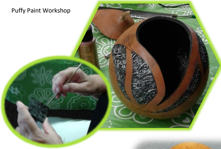
Puffy Paint Workshop