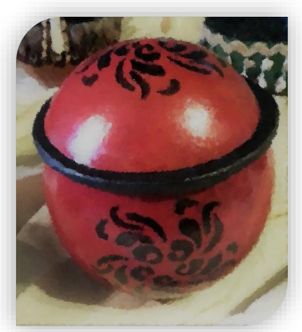
Janet's Tight-fit Lid