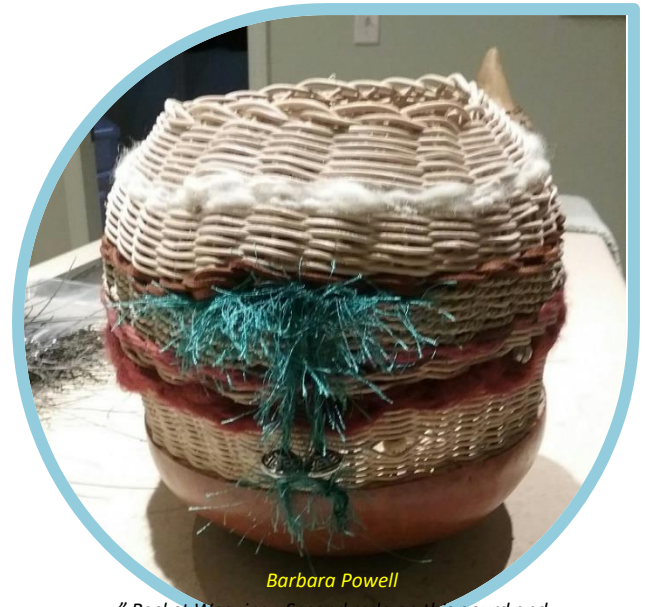
"Basket Weaving. Second redo on this gourd and still not happy. I'm going to have to practice shaping the basket."